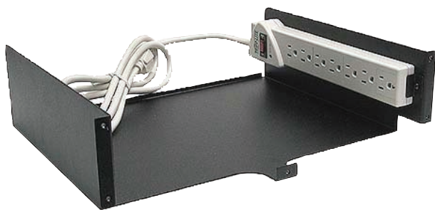
RDMS-4U02 RDMS-4U01 (without power strip) Attaches to RDMB-3U01 and RDMB-4U01