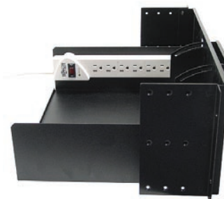
RDMB-4U01 with RDMS-4U02 Attached

We offer OEM and custom designs for your applications. Contact us for additional information.