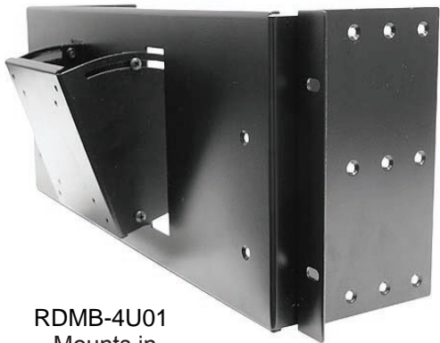
RDMB-4U01 Mounts in 4U of Rack Space

The adjustable mounting bracket RDMB-4U01 has VESA mount holes for 75x75 mm and 100x100 mm monitors. 100x200 mm monitors can be mounted with an adapter plate. This bracket mounts in 4U (7.0") of vertical rack space and allows the attached monitor to be titled in the down (or up) direction. The bracket in and out depth is also adjustable in 4 different increments. The bracket can also be supplied with an RDMS-4U01/4U02 shelf attached to allow use of space behind the monitor for additional equipment storage.