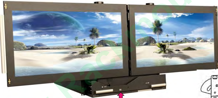
(USB Port for device access)