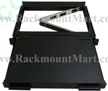
(USB Port for single-port model only)