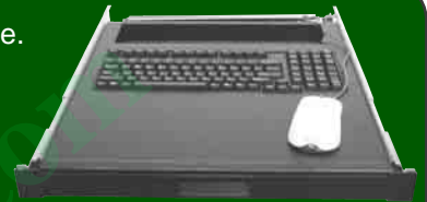
(Mouse is optional)