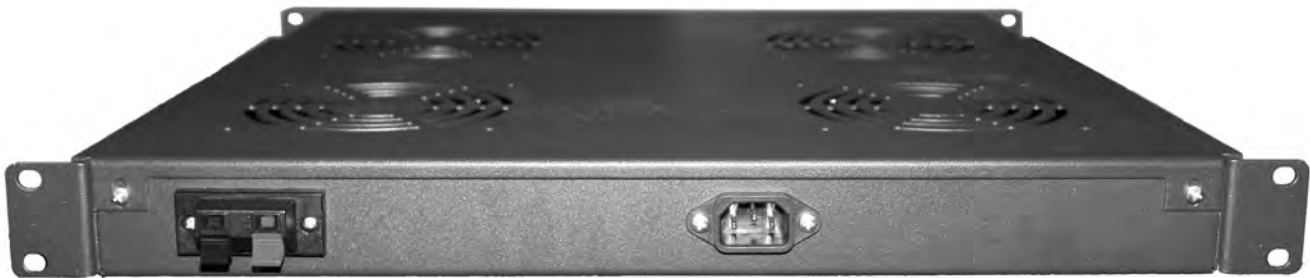
A. Sensor Connector

This fan unit includes a power connector and a connector for a thermal sensor.