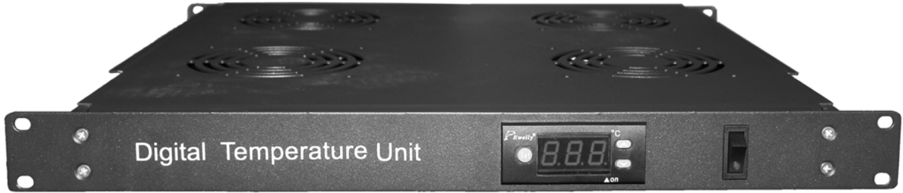
A. LED Display B. ON/OFF BUTTON

This fan unit includes a power switch and a LED thermostat monitor on the front.